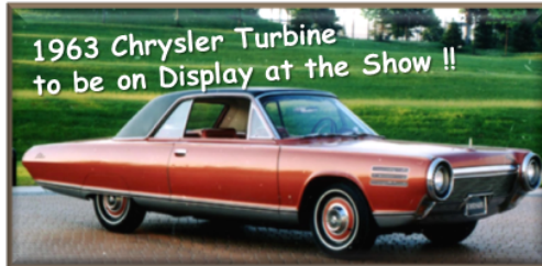
1963 Chrysler Turbine to be on Display at the Show !!