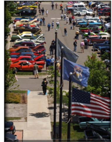
2015 Flier -- rev 04.07.2015

On the grounds of the Walter P. Chrysler Museum 1 Chrysler Drive ~ Auburn Hills, Michigan