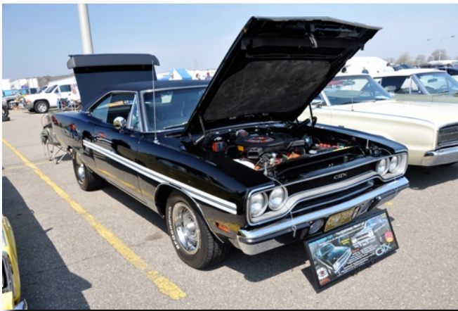
Mike Mordarski's clean 1970 Plymouth GTX