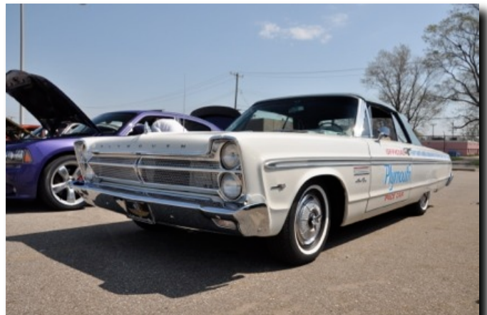
Larry Baker's beautiful 1965 Plymouth Sport Fury Pace Car