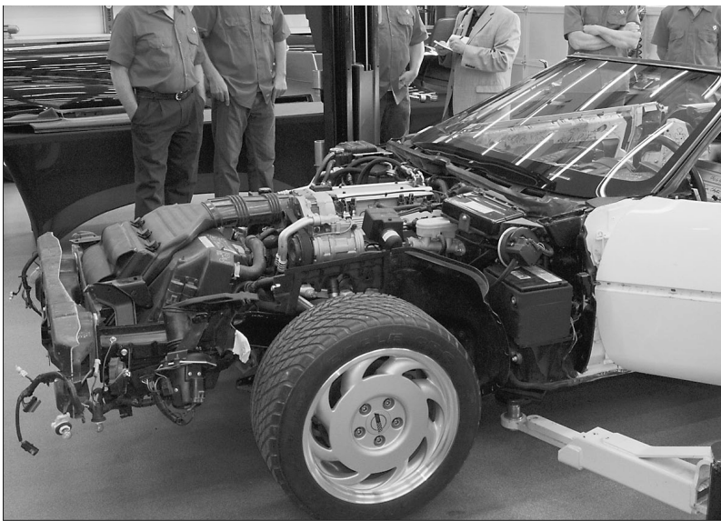
GM Design Center Technicians are repairing damaged, historic 'Vette.