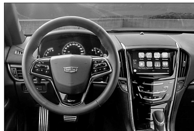
Cadillac makes staying in touch easier than ever.