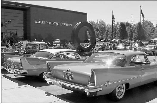
Chrysler employees gathered together and showed off their vintage cars, including a Plymouth Fury and Chrysler 300 C (above) from the 1950s. Below is stock car racer Larry Griffith's 1968 Hemi Dart.