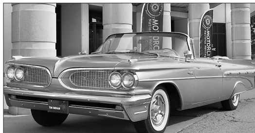
This 1959 Pontiac Bonneville helped kick off Autopalooza 2015.

Autopalooza promotes the region's rich automotive heritage to auto enthusiasts and visitors alike and has a significant economic impact on metro Detroit. The DMCVB calculated that the