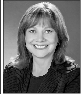
GM CEO Mary Barra

"It's not so much because mud might get splashed on the exter-