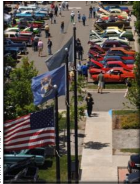
2013 Flier rev 05.06.2013

ALL Makes and Models of Cars and Trucks are Welcome !